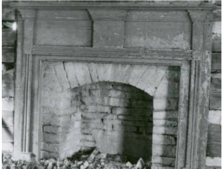
The original kitchen fireplace and mantel

The four fireplaces had been boarded up before the house was dismantled. When the kitchen fireplace, shown here, was opened, the original iron crane was found to still be in place. Three of the four neoclassical-influenced mantelpieces were preserved. "It is obvious that a carpenter of unusual ability designed and built these features," Roberts wrote.