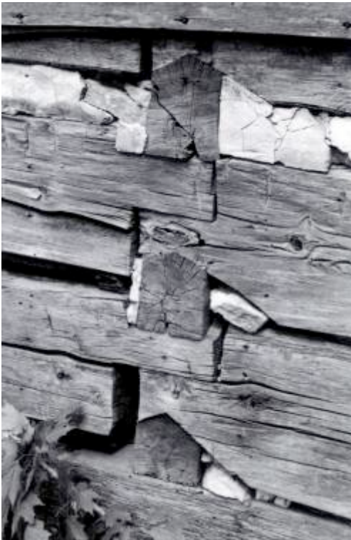
Three-way corner notching

Corners were constructed by selecting a form of notch that varied for a variety of practical reasons ("How much time do we have before winter comes?") and cultural reasons ("This is the way we have always done it!").