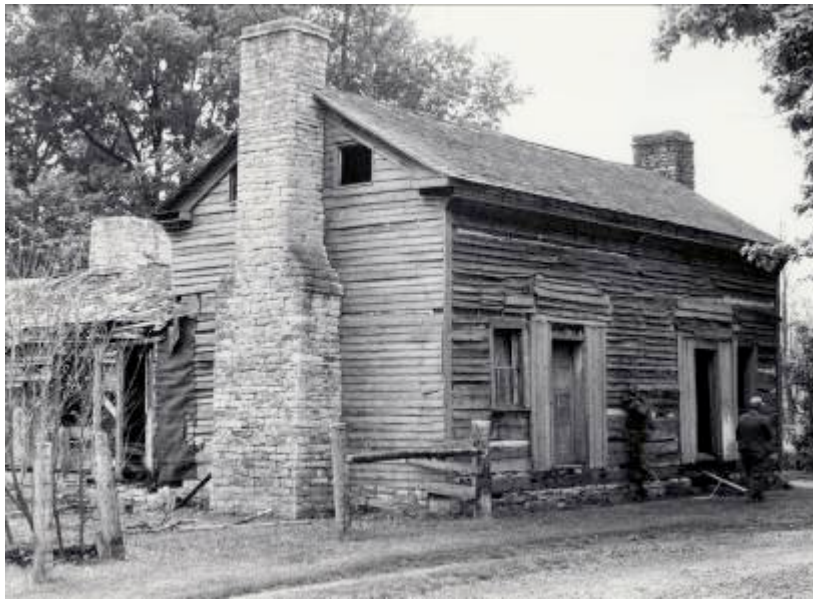
The Whitaker-Waggoner house, front view

North of the town of Paragon in Morgan County, Indiana, Warren Roberts discovered a nearly two-story, two-room log house built in 1820 and known today as the Whitaker-Waggoner house. Each room had its own fireplace and exterior limestone rubble chimney. The two front doors are original and, with the two gable chimneys and the interior floor plan characterize the house as a double-pen house.