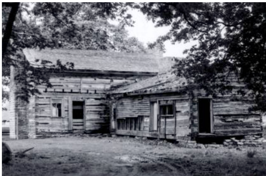
The Whitaker-Waggoner house, rear view

A two-room rear wing, or ell, built of both frame and log construction was added a few years later. The log portion is at the gable end and the frame portion adjoins the original house.